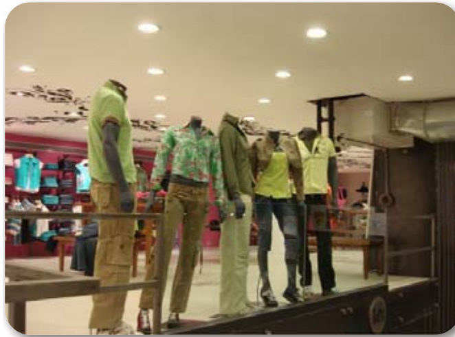
👉 Standing tall in Delhi

First it was their 4,000 sq. ft. showroom at Pune. And now, the brand's Delhi and Ahmedabad outlets! Herculan IG Decorative and Lee Stores have become inseparable. And why not! After all, just like Pune, the 2,800 sq. ft. and 1,200 sq. ft. showrooms in Delhi and Ahmedabad, respectively, are eager to enjoy the attractive benefits that this world-class surface has to offer.