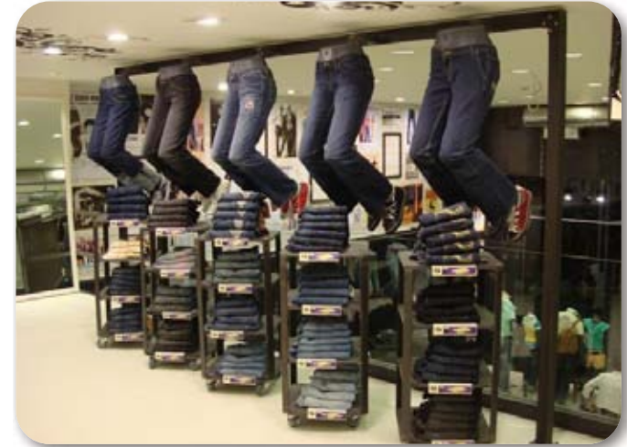
👉 Ahmedabad: poised for impact