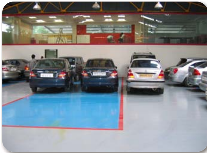
🏠 Providing elegance, efficiency and safety

With the flooring making huge strides ever so quickly, expect awareness and popularity to go into overdrive very soon.