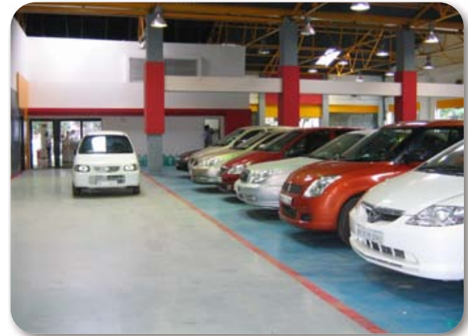
🏠 Adding sheen to steel