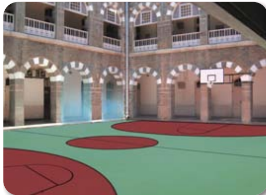
📍 The Cathedral & John Connon School, Mumbai