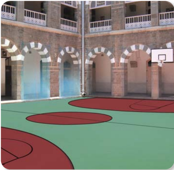
↑ Herculan Outdoor - Basketball court at The Cathedral & John Connon School, Mumbai