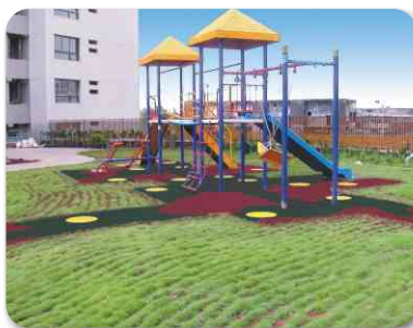
◆ Surela Investments, Mumbai

The project overseers are extremely happy and satisfied with the world class quality and safety standards on offer.