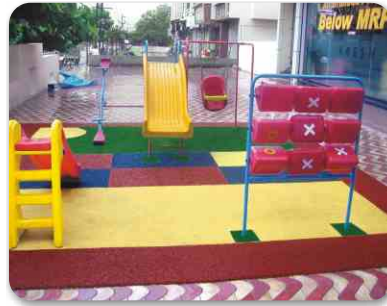
📍 'SPAR' Food Mall, Thane

One of the most extensive retailers across the globe, 'SPAR' marks its presence with a huge food mall in Tikujiniwadi, Thane. Here it has laid Playsafe especially