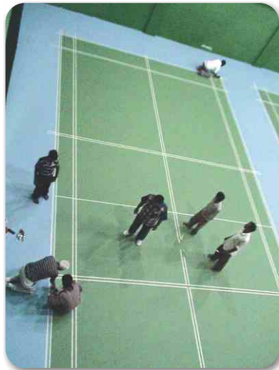
◆ Marking of lines at Solaris Fitness World, Pune

Herculan MF has recently been installed at Club Solaris for three badminton courts measuring upto 4,200 sq.ft. These are multifunctional; they can also be used as basketball practice courts. Securing this first order after the tie-up with Herculan, EcoFlex is now poised to establish a new trend of using world-class flooring in India.