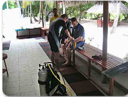
◆ Taj Coral Reef Resort, Maldives

It is today one of the finest resorts in Maldives, offering best in-class luxury and comfort. Travelers from across the world prefer Taj Coral Reef over all other