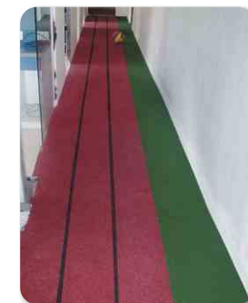
◆ NA Sports Interactive, Goregaon

NA Sports Interactive is a newly established sports data and content company located at Royal Palms, Goregaon. It is built around the theme 'Sports in the Interiors'. Complementing this theme, EcoFlex has laid Runathon for its jogging track inside the office, across an area of 200 sq.ft.