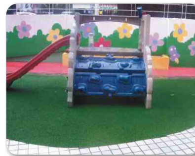
◆ Children's Nook Group of Schools, Thane

Children's Nook Group of Schools is an institution having an experience of over two decades in the field of pre-primary education. It has five prestigious schools in South Mumbai and it recently opened its sixth branch at Vikas Palms, Thane. This was inaugurated by the famous industrialist Mrs. Tina Ambani. The pre-school has installed Playsafe for its play area of 125 sq.ft. This is the first of its kind where EcoFlex has installed its product in a nursery school.